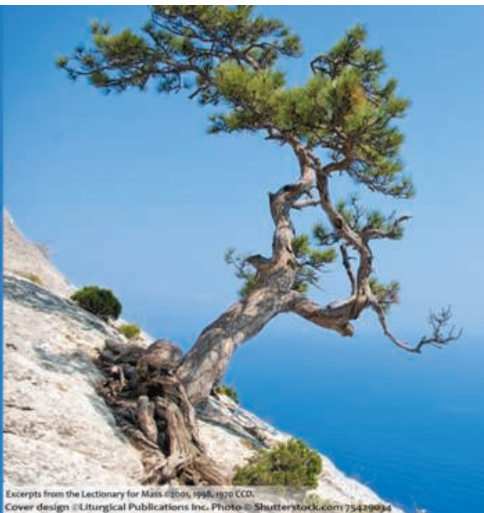
Excerpts from the Lectionary for Mass © 2006, 1998, 1970 CCD. Cover design © Liturgical Publications Inc.